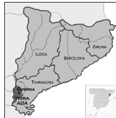
There are 22,793 acres of vineyard land in Terra Alta.

What makes Vinos Piñol unique? 1) Small production wines from low yielding older vines using ecologically friendly methods and manual harvesting in the estate's organically grown vineyards. 2) Producing terroir driven, deeply colored, well structured, well balanced wines. 3) Family owned estate vineyards. 4) Consistent quality year after year. 5) Talented young winemaker Juanjo Galcera Piñol's blending philosophy.